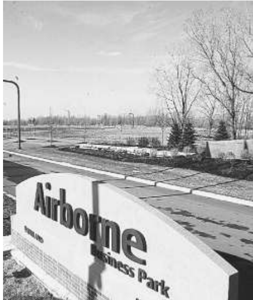
The Interior Department still must approve the Seneca Nation of Indians' plan to locate a casino in Cheektowaga's Airborne Business Park, across Holtz Drive from Buffalo Niagara International Airport.